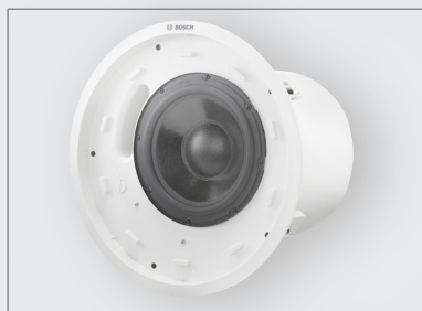
Ceiling sub grille off