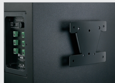
Surface sub wall-bracket mount