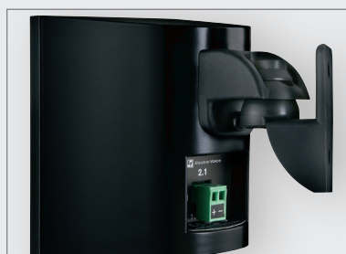
Surface satellite wall-bracket arm