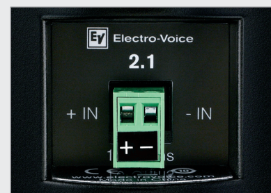
Surface satellite input panel