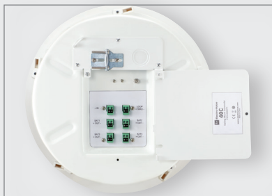
Ceiling sub input panel